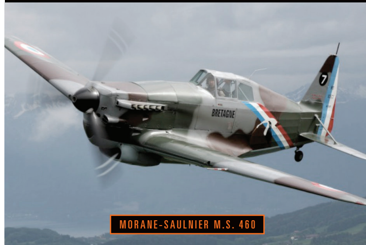
MORANE-SAULNIER M.S. 460