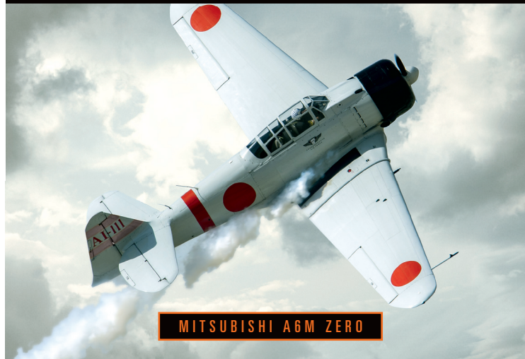
MITSUBISHI A6M ZERO